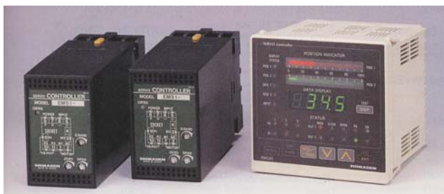
EM51 Series / EMC30 Series